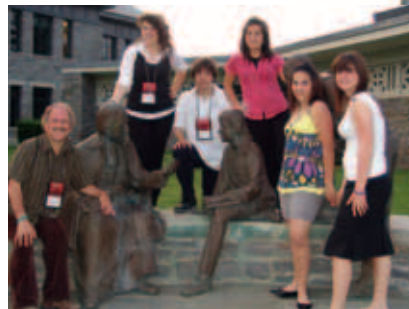
Marist youth from Canada