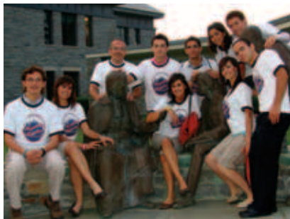
Marist youth from Mexico